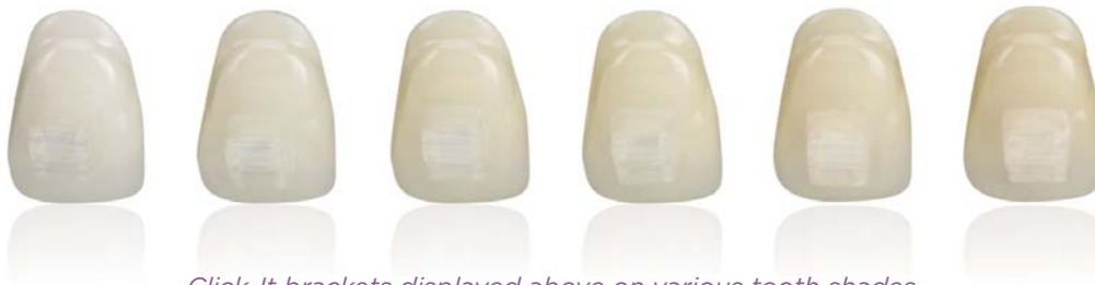
Click-It brackets displayed above on various tooth shades. Click-It is the perfect match for any patient.

Unsurpassed aesthetics are further achieved with a 100% ceramic face, hidden tie-wings and no visible metal parts or clips.